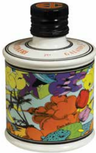
Extra Virgin Olive Oil Taggiasca Quality