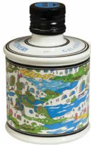
Condiment with Extra Virgin Olive Oil and Chilli