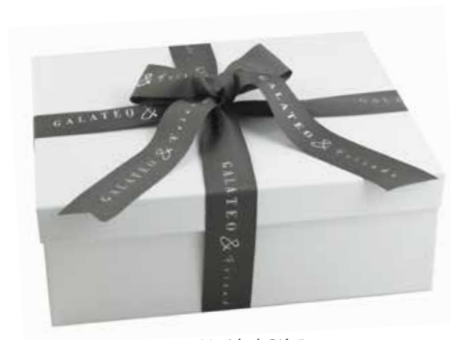
Untitled Gift Box