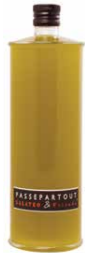
Extra Virgin Olive Oil 1L