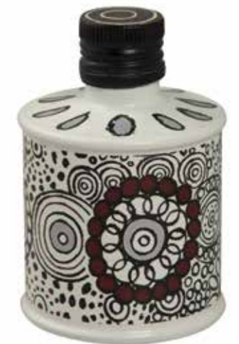
10 Corso Como