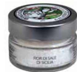
Fior di sale from Sicilia