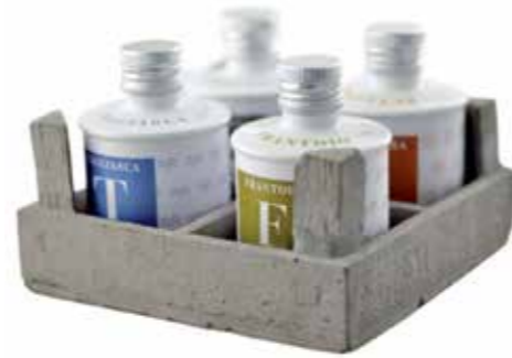
Cement support for four bottles of 0,25 L