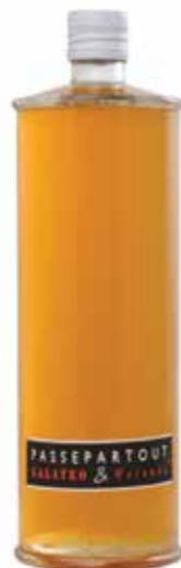
Apple Condiment 1L