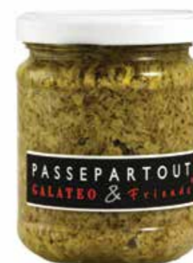
ARTICHOKES CREAM in extra virgin olive oil

This speciality is prepared only with the best, most tender and tasty artichokes. A delicate cream that will give extra taste to your canapés and snacks and will surprise you as sauce for pasta and rice.