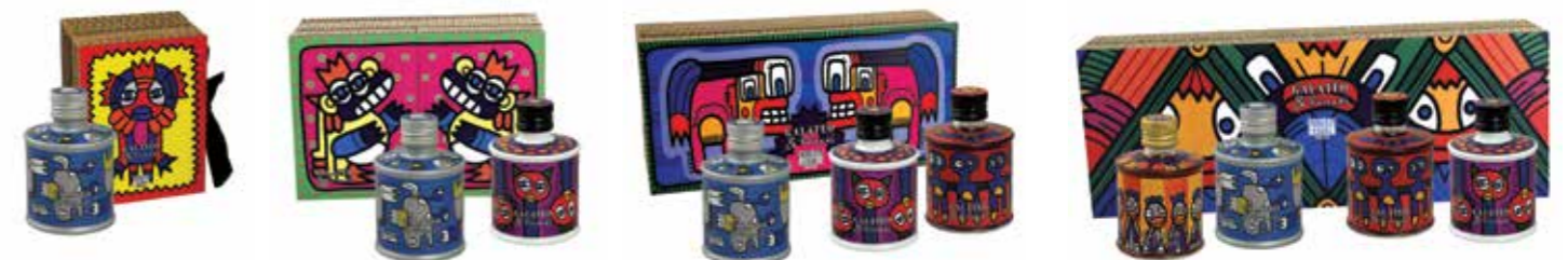
4 Gift Boxes

The creative bond between Galateo&Friends and 10 Corso Como keeps growing and proudly presents the new family members. Multiple designs, graphics and shapes, inspired by the iconic brand, dress up our one and only Extra Virgin Olive Oil and the Balsamic Vinegar of Modena. A perfect combination of food and fashion.