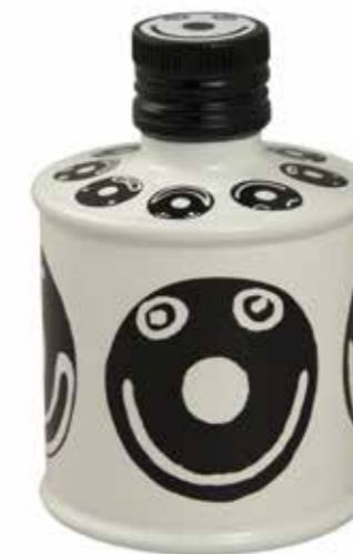
10 Corso Como