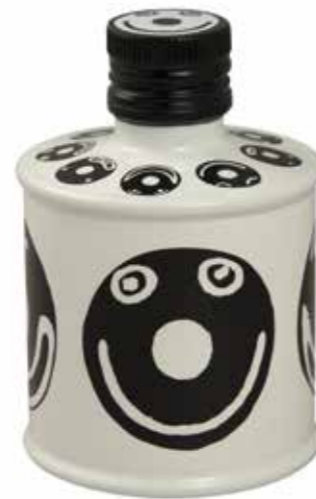
Extra Virgin Olive Oil Taggiasca Quality