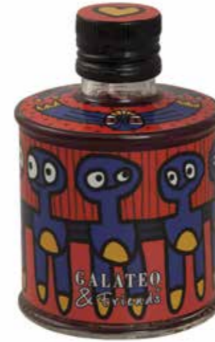
Red Wine Vinegar