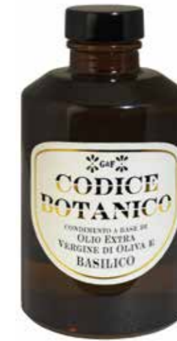
Condiment with Extra Virgin Olive Oil and Basil