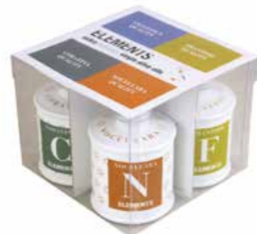
Transparent box for four bottles of 0,25 L

Matches: sed raw on vegetables, salads and oil dip, baking fish and on Mediterranean dishes.