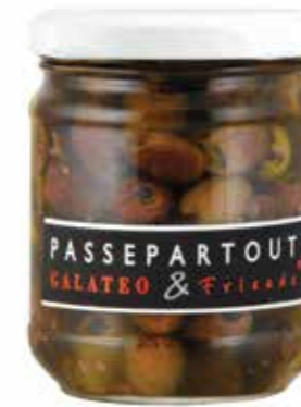
PITTED BLACK OLIVES Taggiasca in extra virgin olive oil

These black olives of taggiasca quality come from the best olive-groves. The drupes, carefully selected, are first pickled and then stoned and preserved in extra virgin olive oil. They are the ideal garnishing for every dish and excellent with aperitifs.