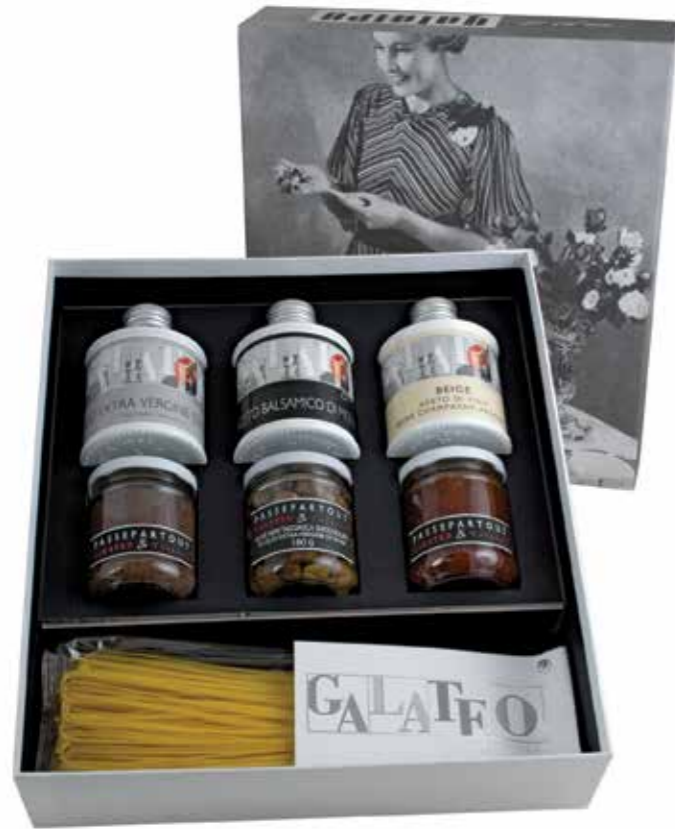
un po' di Galateo Gift Box