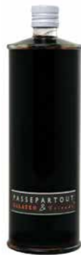
Balsamic Vinegar of Modena 1L