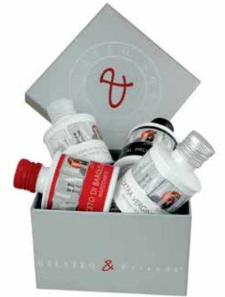
Silver Gift Box