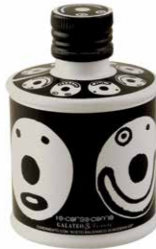
Balsamic Vinegar of Modena