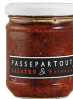
DRIED TOMATOES PASTE in extra virgin olive oil

This speciality is made by selecting the best tomatoes, picked at the peak of ripeness. They are first washed and cut up into pieces, the seeds are removed, and then they are allowed to dry slowly in the sun on mats inside greenhouses. They are subsequently salted and flavoured with the typical herbs of the Liguria region and, lastly, finely chopped and preserved in extra-virgin olive oil. The result is an exquisite-tasting uniformly creamy paste. It is a natural product and contains no preservatives. It can be served with hors d'oeuvres or used to enrich any dish.