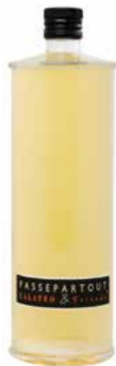
White Balsamic Condiment 1L