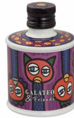
Balsamic Vinegar of Modena