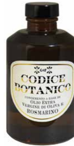
Condiment with Extra Virgin Olive Oil and Rosemary