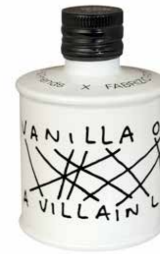
VANILLA OLIVE A VILLAIN LOVE Extra Virgin Olive Oil and Vanilla