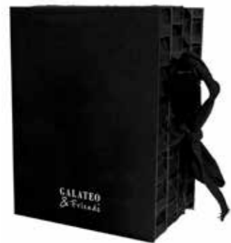
Box for a single bottle of 0,25 L