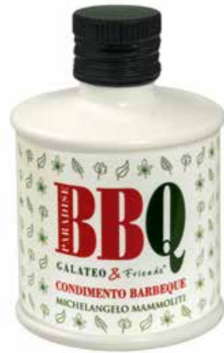
BBQ PARADISE Condiment based on Extra Virgin Olive Oil, Spices and Herbs