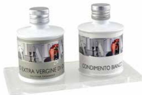
Bottle holder in plexiglass