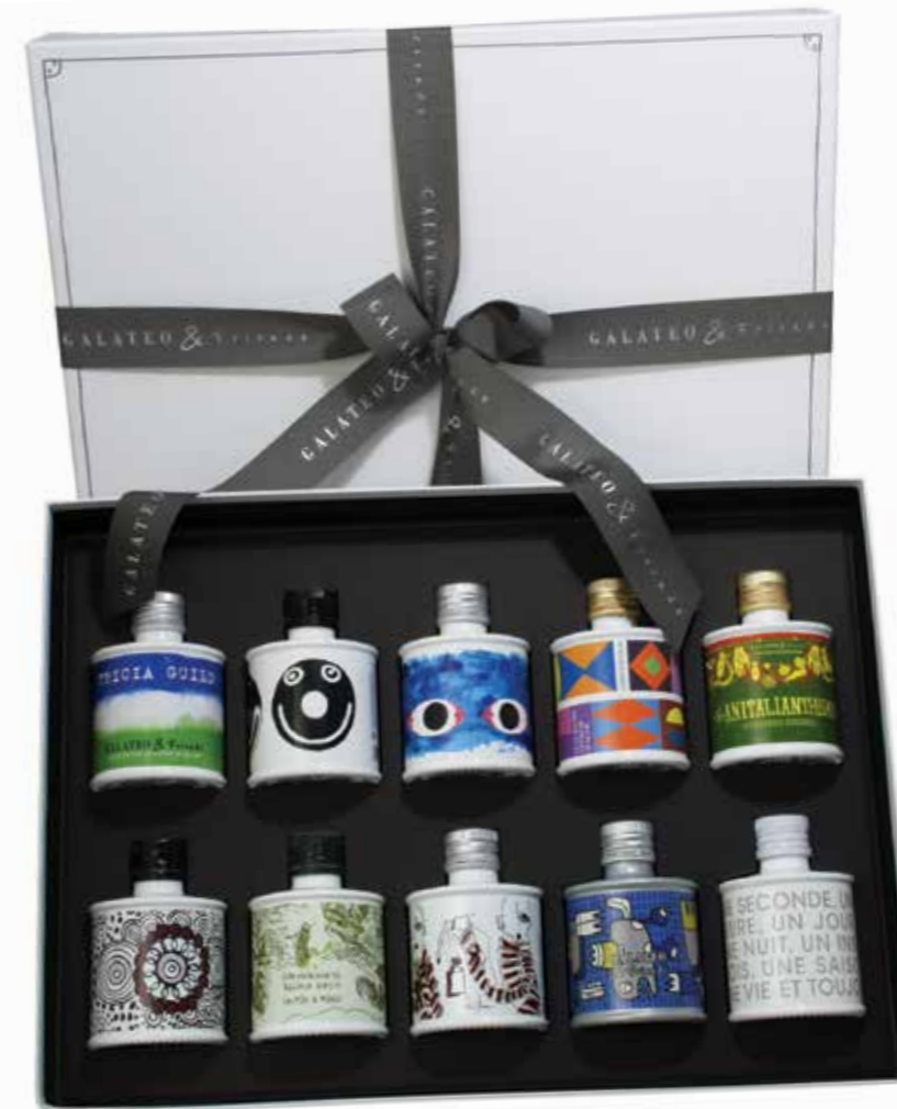
Signatures Gift Box