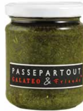
PESTO in extra virgin olive oil

From the original recipe of the Western Liguria, this is a speciality obtained with first-quality ingredients and prepared by mixing the very basil of our Riviera, with pine-nuts, sheep's milk cheese, salt, a touch of garlic and extra virgin olive oil. Added to just strained pasta, it sends forth the sweet scent of its Mediterranean flavours.