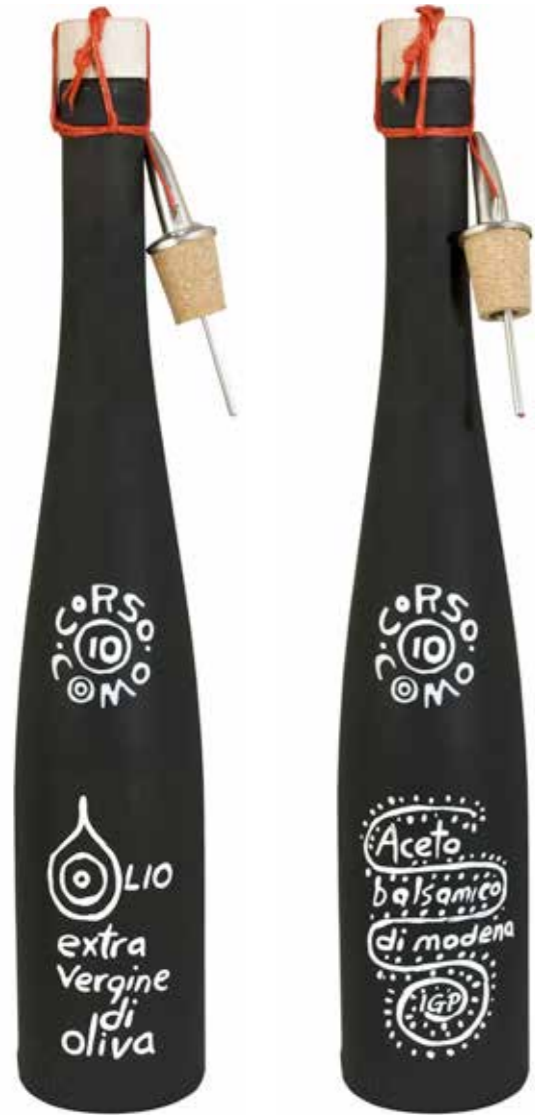
Extra Virgin Olive Oil Taggiasca Quality