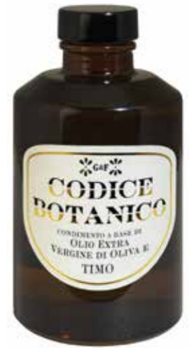
Condiment with Extra Virgin Olive Oil and Thyme