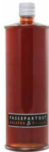
Aged Red Wine Vinegar 1L