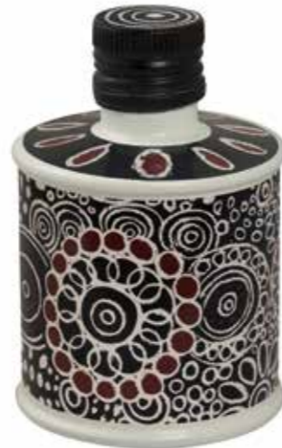
Balsamic Vinegar of Modena