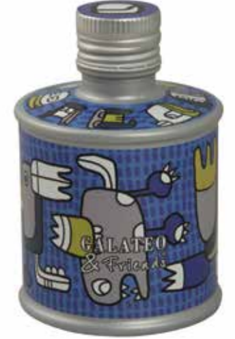
Extra Virgin Olive Oil Taggiasca Quality