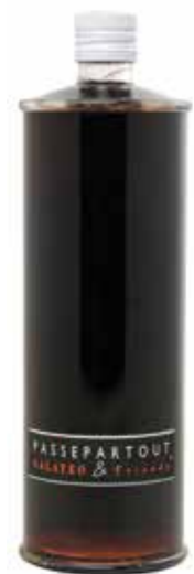
Pomegranate Condiment 1L