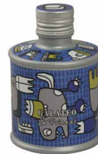
Carlo Volpi - Public Code