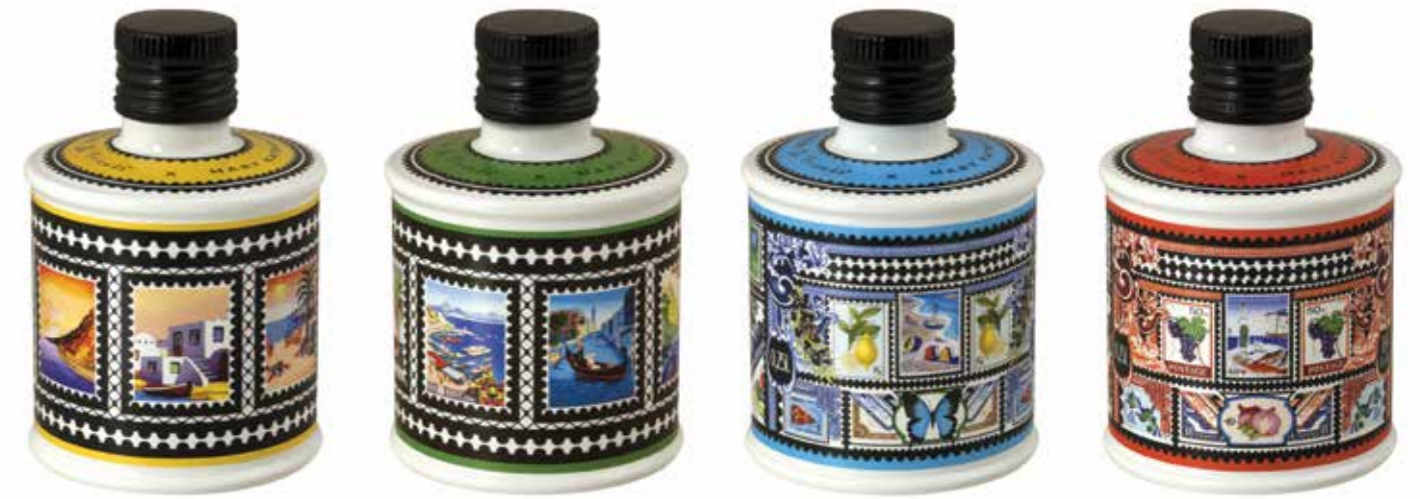
Extra Virgin Olive Oil Taggiasca Quality