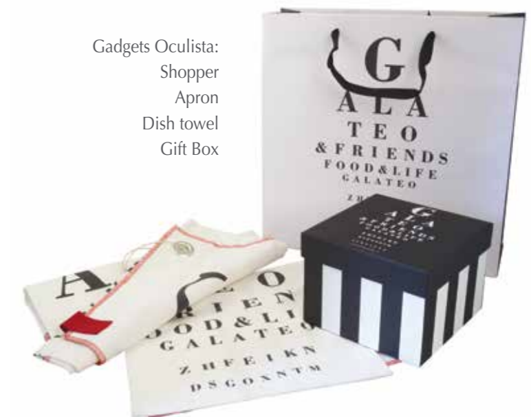
Gadgets Oculista: Shopper Apron Dish towel Gift Box