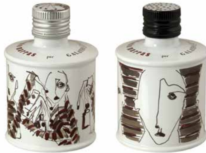
Extra Virgin Olive Oil Taggiasca Quality