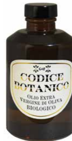
Extra Virgin Olive Oil Organic