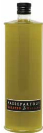
Lemon Condiment 1L (E.V.O. Oil and Fresh Lemon)