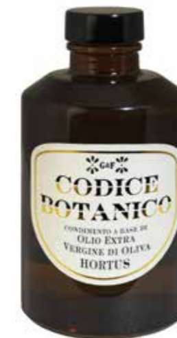
Condiment with Extra Virgin Olive Oil and Herbs