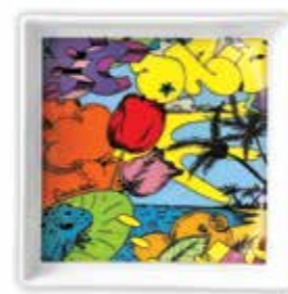
Porcelain dipping dishes