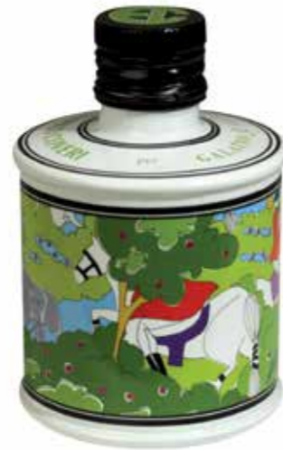
Condiment with Extra Virgin Olive Oil and Basil