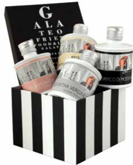
Oculista Gift Box