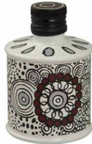
Extra Virgin Olive Oil Taggiasca Quality