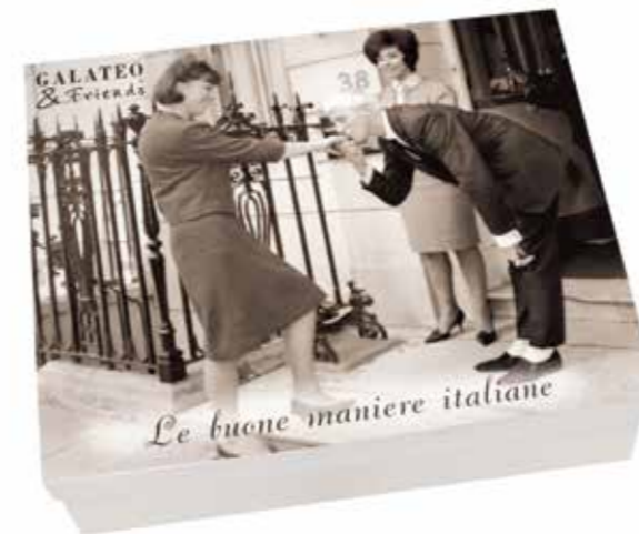
Baciamaio Gift Box