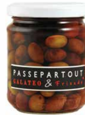
PICKLED BLACK OLIVES Taggiasca in brine

Gathered at the right time of ripening the best black olives are selected and pickled, using the aromatic herbs of our Ligurian Riviera: thyme, sage, rosemary and laurel to flavour them. They perfectly match with baked meat and fish and are ideal to be tasted with aperitifs.