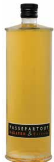
Wine Vinegar 1L "REIME CHAMPAGNE - ARDENNE"