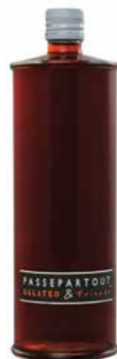
Barolo Wine Vinegar 1L