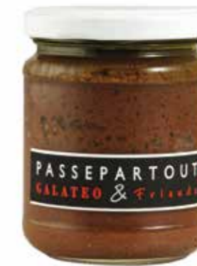
BLACK OLIVES PASTE Taggiasca in extra virgin olive oil

It is produced with pickled black olives and aromatized with the flavours of our Riviera. The drupes are separated from the stones and their pulp is finely ground: adding extra virgin olive oil it becomes pasty and creamy. Fit to prepare appetizers, canapés and snacks: it is the ideal dressing for spaghetti.