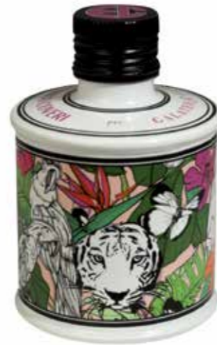
Chianti Wine Vinegar